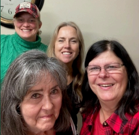
December 17 th Prayer Group