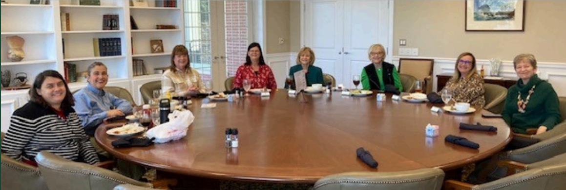
December 11 th Off-Campus Lunch Group Rudy's BBQ